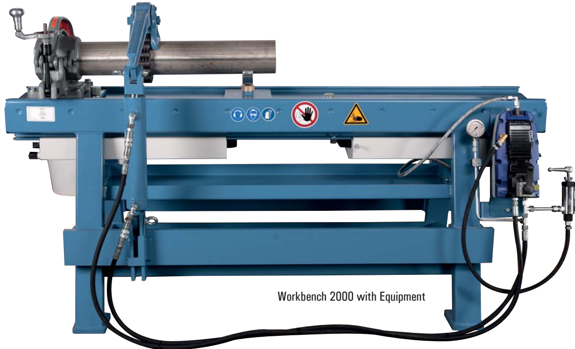
Workbench 2000 with Equipment